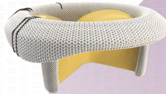
MITRIS RESILIA mitral valve

*No clinical data are available that evaluate the long-term impact of RESILIA tissue in patients. Additional clinical data for up to 10 years of follow-up are being collected to monitor the long-term safety and performance of RESILIA tissue.